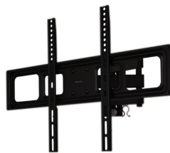
ARTICULATING WALL BRACKET